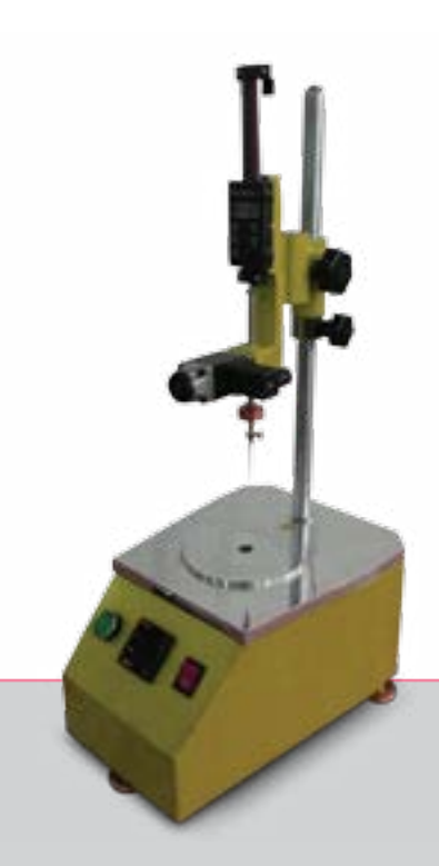
Semi-Automatic Digital Penetrometer (A-090/SA)

A-090 Hand-operated model with a digital indicator to be used with a stopwatch.