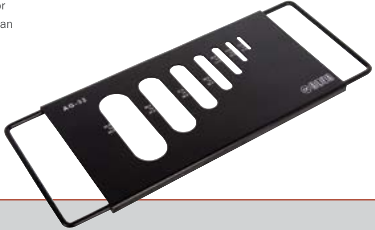
Thickness / Flakiness Gauge (AG-032)