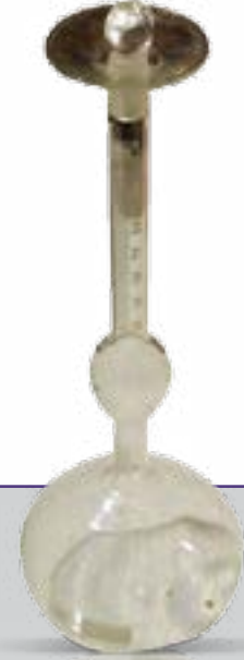
Le Chatelier Flask (C-022)