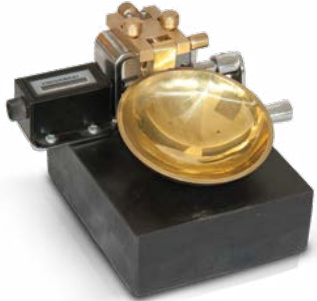
Liquid Limit Device (T-030)